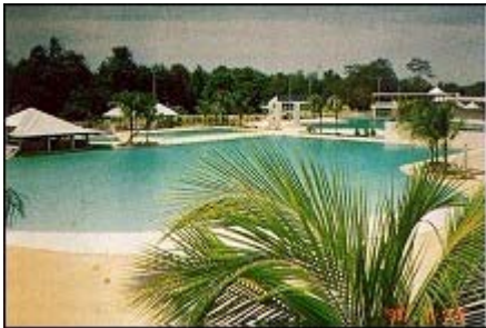
Swimming pool in East Malaysia waterproofed with the 3CC SYSTEM. Cementaid Weldcrete bonding agent was incorporated in the tile mortar.