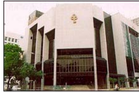
The raft slab of this deep three level basement was completely waterproofed with 3CC SYSTEM concrete.

Reduced construction time and cost, space saving, simplified design, ease of repair and guaranteed performance, make the 3CC SYSTEM the natural practical preference to other waterproofing methods.